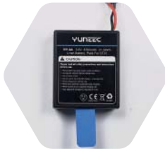
YUNST16100 1 pc of Li-ion battery