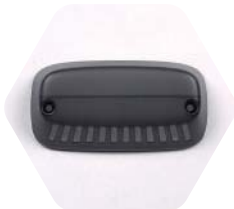
YUNTYH111 TYPHOON H three color lampshade