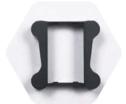
YUNCGO3P104 1 pc of rubber damper protective cover