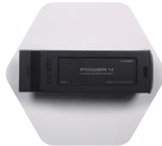
YUNTYH105 TYPHOON H battery