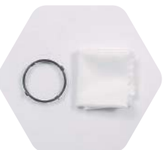
YUNCGO3113 1pc of UV filter 1pc of cleaning cloth