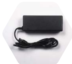
YUNTYHFSP090 AC to DC adapter for TYPHOON H