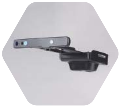
YUNTYHR RealSense for TYPHOON H