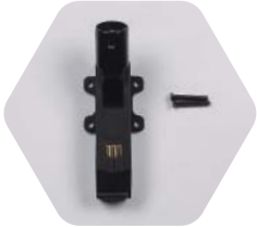
YUNTYH109 1 pc of TYPHOON H landing gear