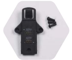
YUNTYH108 Gimbal connection bracket 3 pcs of grub screws Gimbal connection board