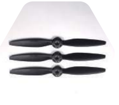
YUNTYH118A 3 pcs of Propeller / Rotor Blade A and other accessories