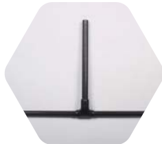
YUNTYH110 Landing gear three-way connector and other accessories