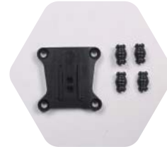
YUNCGO3P101 black color top and bottom mount plus 4pcs of gimbal mount dampers