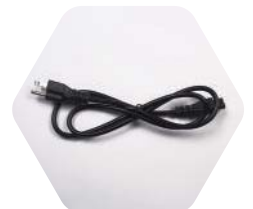
YUNTYHFSP090EU AC to DC adapter power cable with EU plug