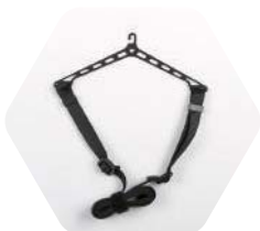
YUNST12103 1 pc of Neck Strap and 1pc of Neck Strap Mount for ST12