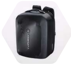
YUNTYHBP Backpack for Typhoon H