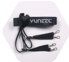
YUNST16101 1 pc of Neck Strap and 1pc of Neck Strap Mount for ST16