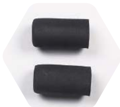
YUNTYH119 2 pcs of black foam damping