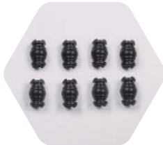
YUNCGO3P102 8 pcs of gimbal mount dampers