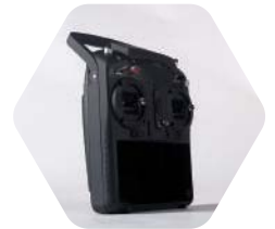
YUNST12HEU 1 pc of ST12 with battery, charger and any other accessories