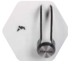
YUNCGO3P103 1 pc of black cover and Yuneec Decal; 6 pcs of screws*