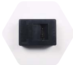
YUNTYHSC4000-4 SC4000-4 charger