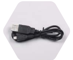
YUNTYH115 USB to Micro USB cable