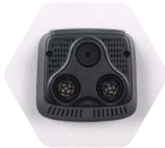
YUNTYHIPS 1 pc of IPS ( Indoor Positioning System ) for TYPHOON H