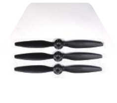
YUNTYH118B 3 pcs of Propeller / Rotor Blade B and other accessories