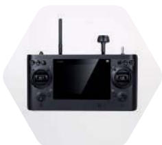
YUNST16EU ST16 with battery, charger and any other accessories