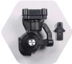
YUNCGO3PEU CGO3+ with black color mounting parts and arms plus any other accessories