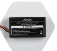
YUNST10100 1 pc of Li-ion battery